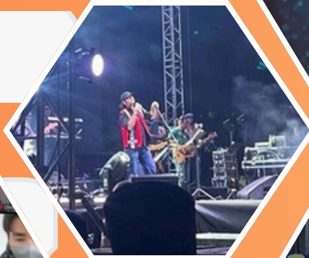
Taarangana, Annual Cultural Fest