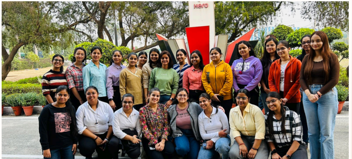
Hero Moto Corp, Dharuhera Plant