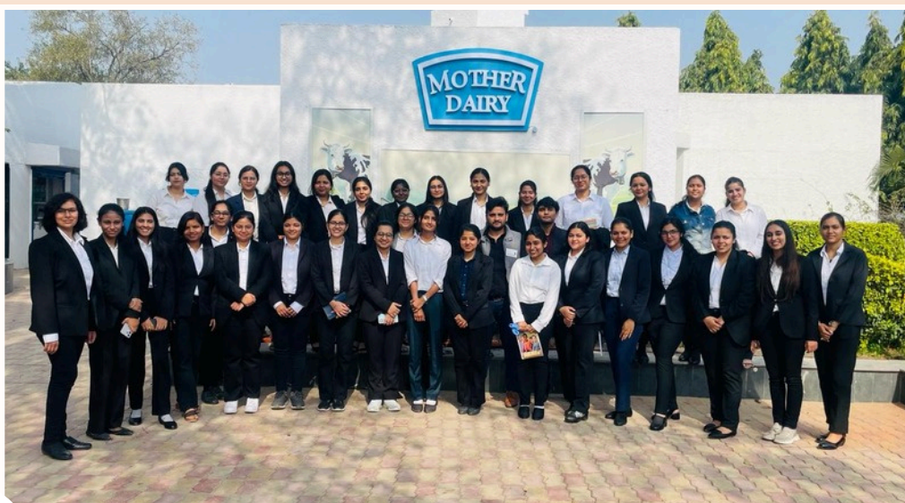
Mother Dairy Plant, Patparganj, Delhi