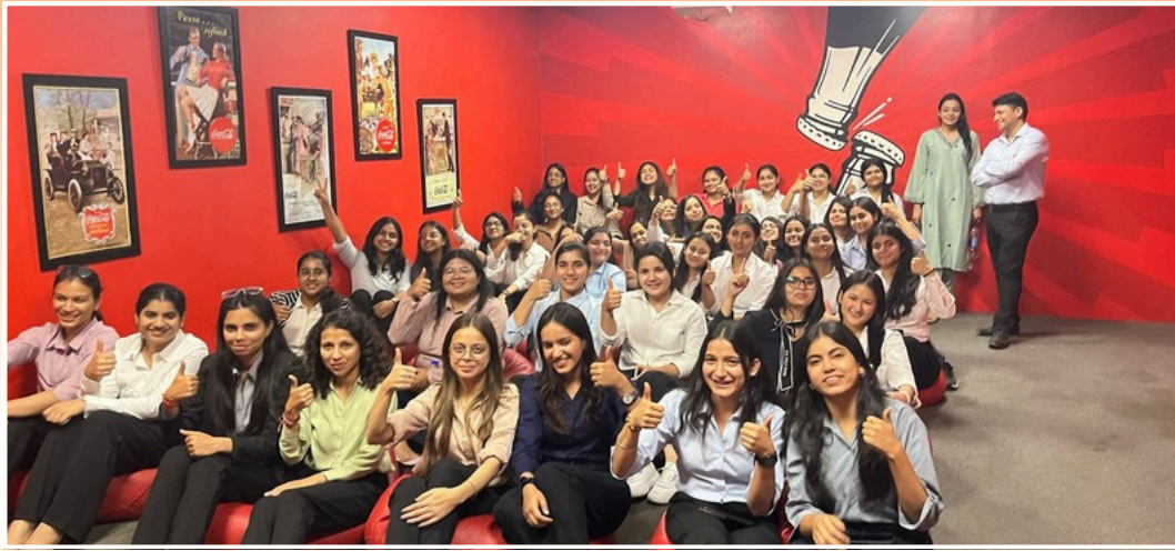
Coca Cola, Moon Beverages LTD Greater Noida